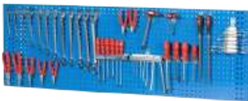
WS-3000 Panel perforado Perforated Tools board