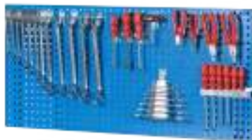
WS-3015 Panel perforado Perforated Tools board