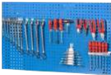
WS-3010 Panel perforado Perforated Tools board