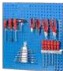
WS-3025 Panel perforado Perforated Tools board